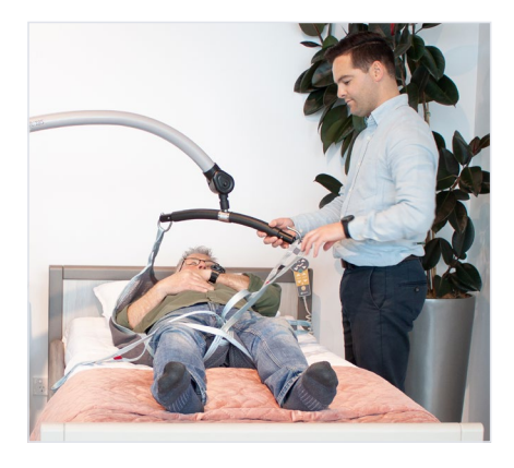
Patented Ergolet® spreader bar hooks