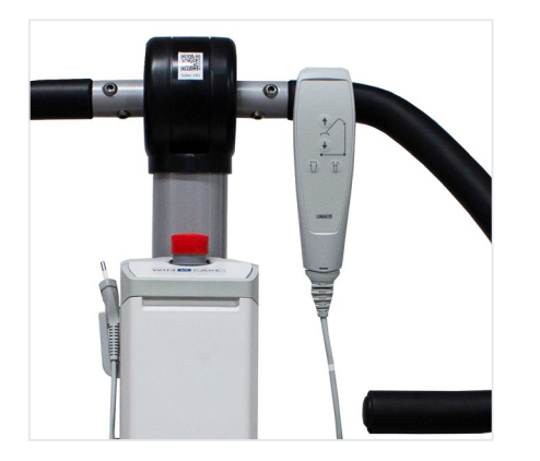
Easy to find emergency stop