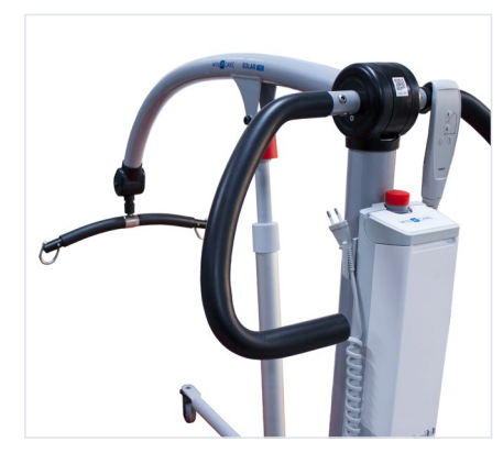
Ergonomically shaped handles